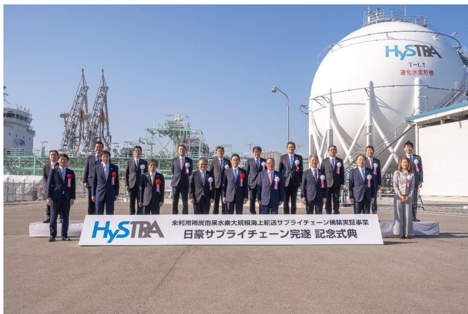
Ceremony for completing the demonstration test

The HySTRA ※1 joint venture, comprising Iwatani Corporation, Kawasaki Heavy Industries, Ltd., Shell Japan Ltd., Electric Power Development Co., Ltd.(J-POWER), Marubeni Corporation, ENEOS Corporation, and Kawasaki Kisen Kaisha, Ltd. with support from NEDO ※2 , is exploring the development of a large-scale marine transport supply chain.