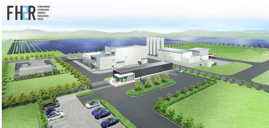
Image of FH2R

NEDO, Toshiba ESS, Tohoku Electric Power Co., Inc. and Iwatani Corporation will continue to contribute to realize a hydrogen economy.